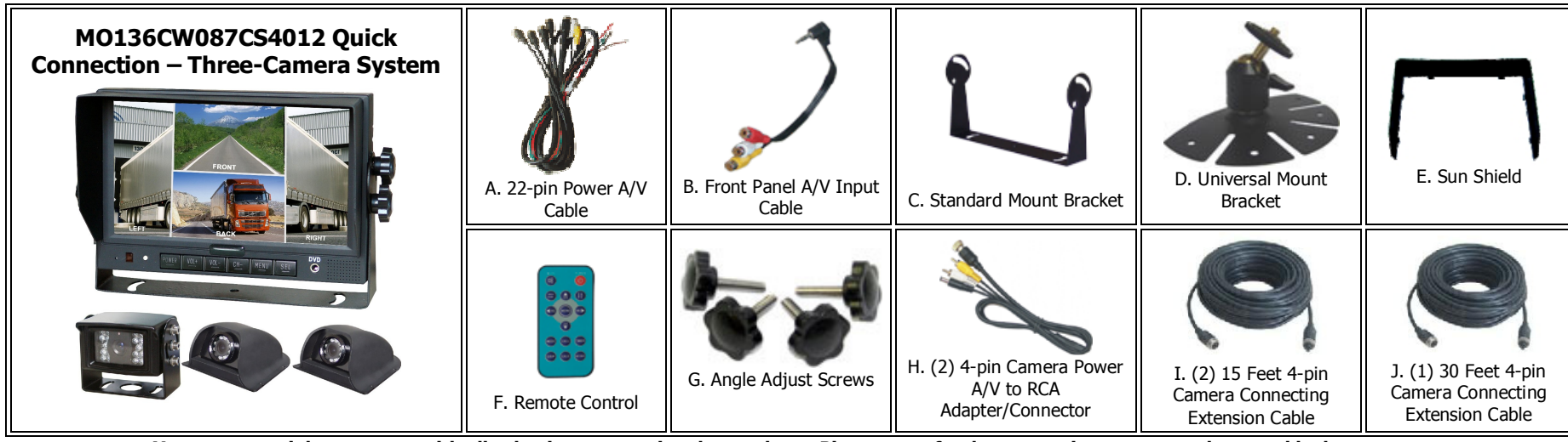
Your system might not come with all selective accessories shown above. Pictures are for demonstration purpose only; actual look may vary.